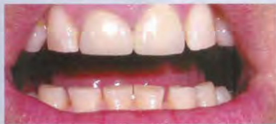
Bruxing can wear down and destroy your teeth.

D oes your jaw feel stiff or do you have difficulty opening your mouth wide? Are your teeth sensitive to cold drinks? Do your jaw muscles feel tired in the morning? You may be grinding your teeth at night (a medical condition called bruxism) or you may be clenching your teeth, which can be just as harmful. People with nighttime grinding habits may wear away their tooth enamel "ten times faster" than those without "abusive chewing habits." 1 Eventually, your teeth may be worn down and destroyed.